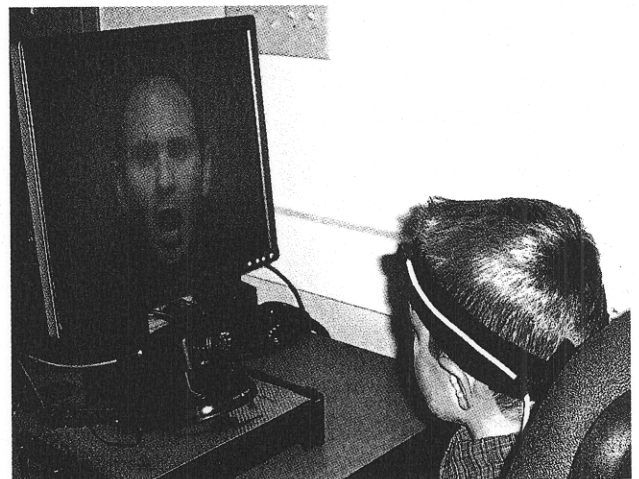
Fig. 1. A participant views a speaker using an eye tracker.

Each subject was placed in a chair 25 inches from a computer monitor. The headband with the magnetic head tracking sensor was placed on each participant's head (see Fig. 1). The participant's pupil coordinates were calibrated with the eye-tracker system by asking the participant to look at col-