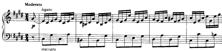
Fig. 1. Initial bars of the four pieces used in Experiment 1.