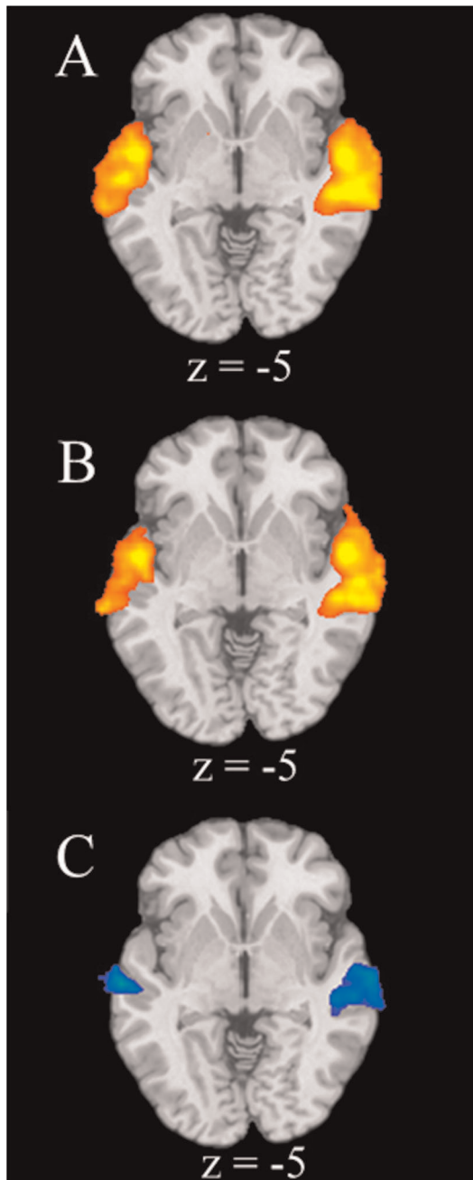
Figure 1. Regional Brain Activations during the Perception of Infant Cries. Axial slices of regional brain activations for a) low-distress cries versus pink noise, b) high-distress cries versus pink noise, c) and high-distress cries versus low-distress cries. Color on T1 template images from SPM5 indicates significant increases (red color) and decreases (blue color) in BOLD signal. The right side of the brain is on the right. The number under each brain image indicates z-axis coordinates of the image in the MNI (Montreal Neurological Institute) template space. The only voxels displayed on the brain images are regions with corrected p < .05 threshold at an uncorrected voxel-level threshold of p < .01 at each tail and a cluster of 45. doi:10.1371/journal.pone.0036270.g001

face contrasts correlated with self-reported measures of behavioral inhibition and activation suggesting that neural responses to infant stimuli vary as a function of motivational approach and avoidance tendencies.